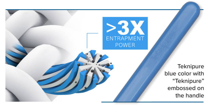
Microfiber material structure Enhanced cleaning capabilities, capturing the smallest particles and fibers and retaining them inside the material